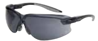
1654102 • Smoke Lens