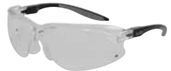
1654101 • Clear Lens