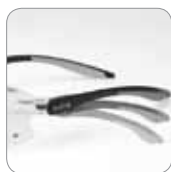
Tilt Adjustable Arms