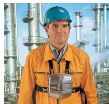
SSR 30/100 B