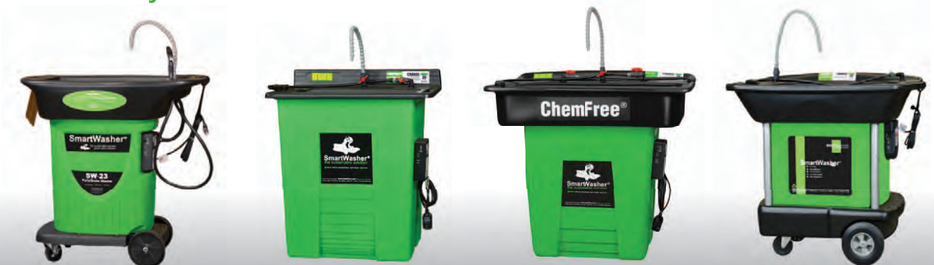
Mobile Parts/Brake Washer SW-23